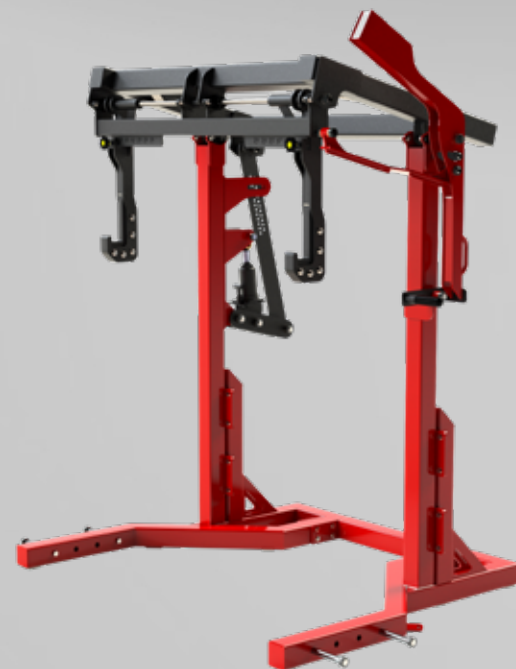
Weights and bars sold separately. Cages may be pictured with extra options or accessories.