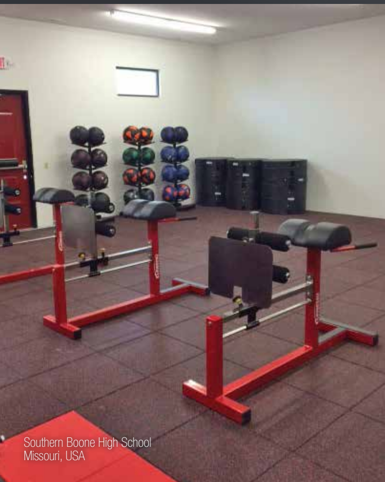
Southern Boone High School Missouri, USA