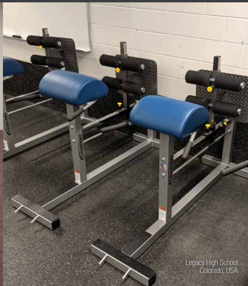
Legacy High School Colorado, USA