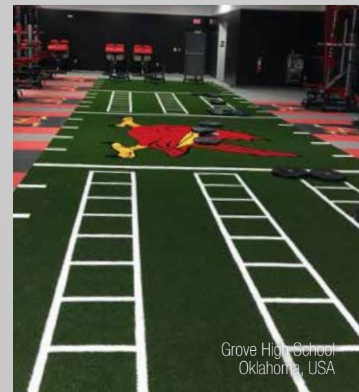
Grove High School Oklahoma, USA

Build speed and agility indoors. Available in rolls or interlocking tiles. Solid rubber base layer with dense nylon wear layer. Layers fused for extra durability. Less force reduction, but more energy restitution. Yard lines and custom logos available.