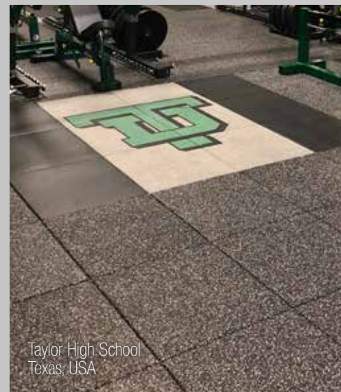
Taylor High School Texas, USA

Non-permanent, great for weight training. Tiles are available with beveled edges or in flush interlocking. Not glued down. Professional installation not required. Composition rubber atop a molded base. Near-equal amounts of force reduction and energy restitution. Platform areas and custom logos available.