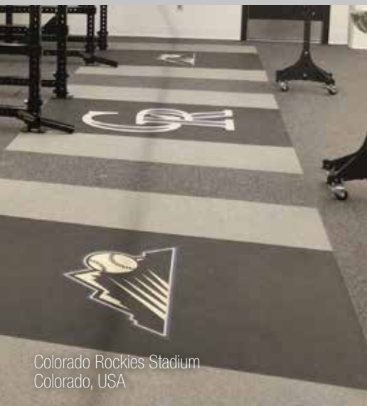
Colorado Rockies Stadium Colorado, USA

Affordable, easy to maintain. Near-seamless, cleaner look. Glued down. Requires professional installation. Solid composition rubber or combination composition rubber and shock pad options available. Less force reduction, but more energy restitution. Platform areas and custom logos available.