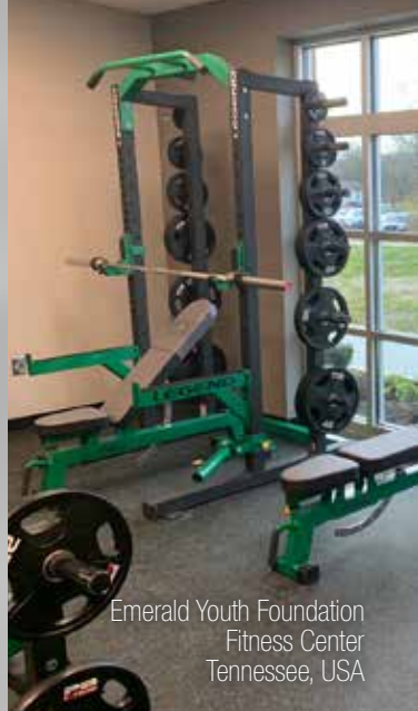
Emerald Youth Foundation Fitness Center Tennessee, USA