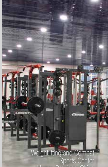
Weightlifting and Combat Sports Center Henan Province, China