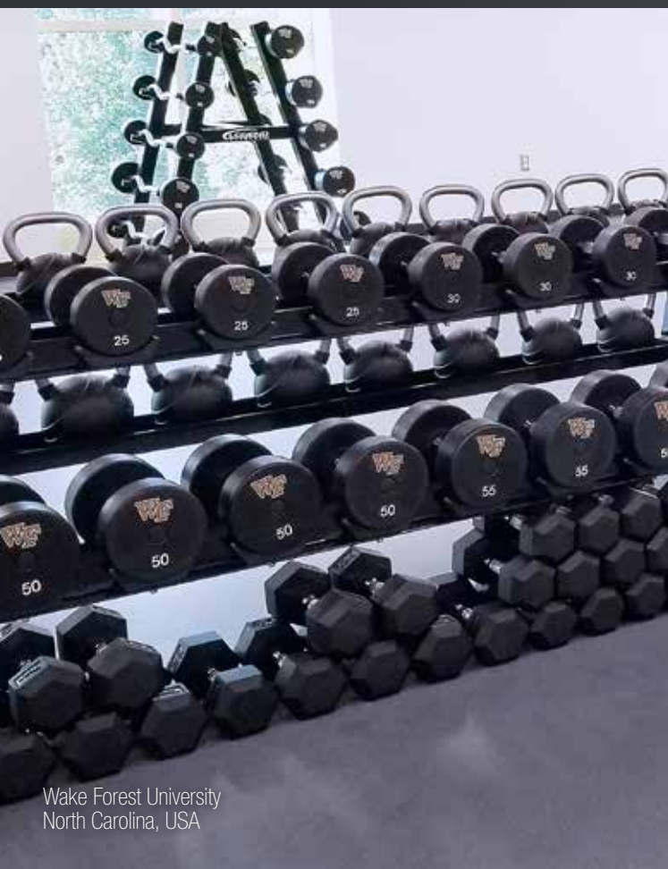
Wake Forest University North Carolina, USA