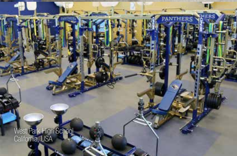
West Park High School California, USA