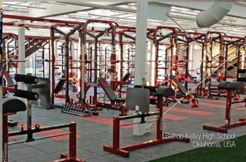
Bishop Kelley High School Oklahoma, USA