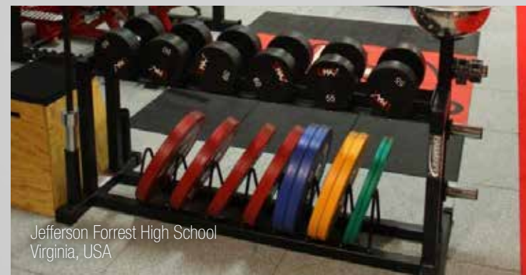
Jefferson Forrest High School Virginia, USA

It should come as no surprise that we have relationships with some of the best weight manufacturers. When it comes to specialty bars, free weights, kettlebells, plates, bumpers and more, we can help you make sure everything is ready to go.