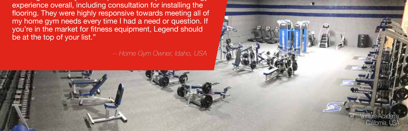
Venture Academy California, USA