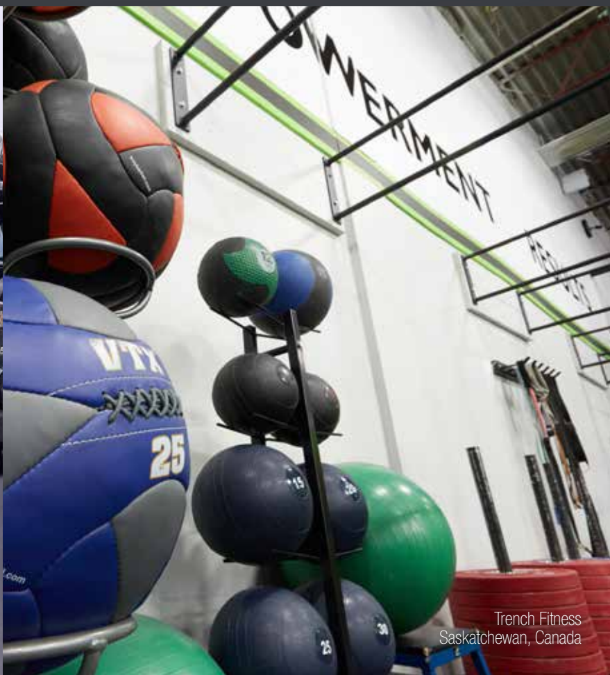
Trench Fitness Saskatchewan, Canada