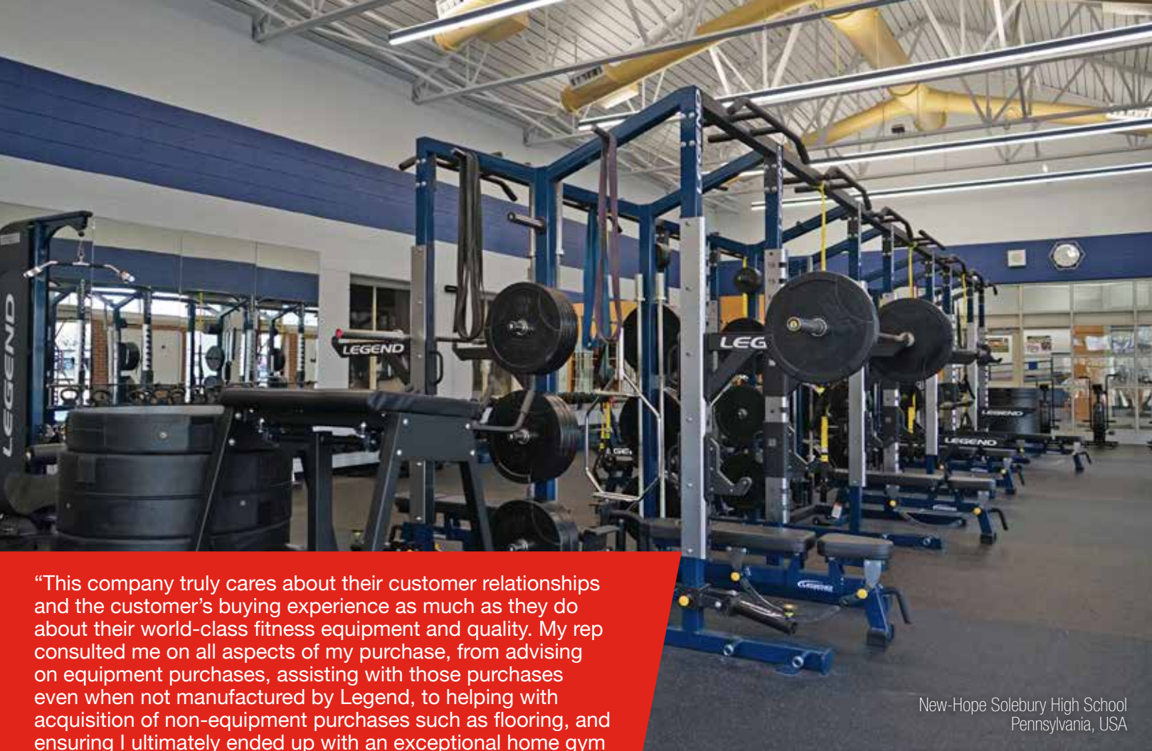
New-Hope Solebury High School Pennsylvania, USA

FOR FULL WARRANTY INFORMATION VISIT LEGENDFITNESS.COM/GUARANTEES