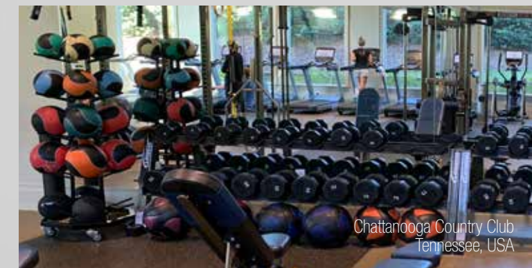
Chattanooga Country Club Tennessee, USA

Legend Fitness also has the hookup when it comes to gym accessories. We can get workout bands, chains, belts, medicine balls, bosu balls, foam rollers... pretty much anything you can think of to put the finishing touch on your gym.