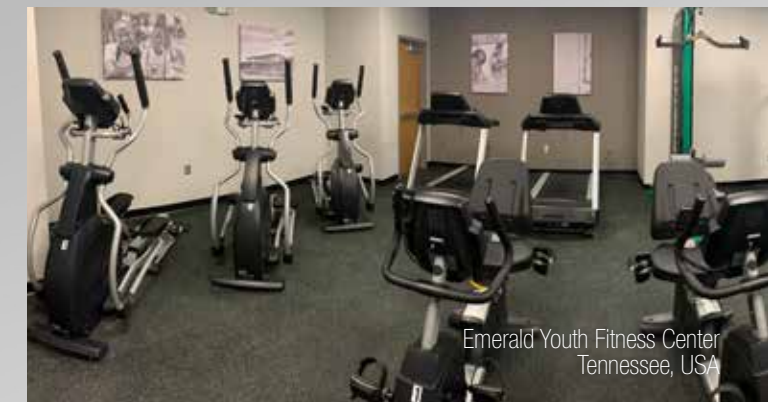
Emerald Youth Fitness Center Tennessee, USA

Legend Fitness is a certified retailer of several popular brands of cardio equipment. From treadmills and elliptical machines to upright and recumbent cycles, and more, we can work with you to fill your space with top-of-the-line cardio equipment.