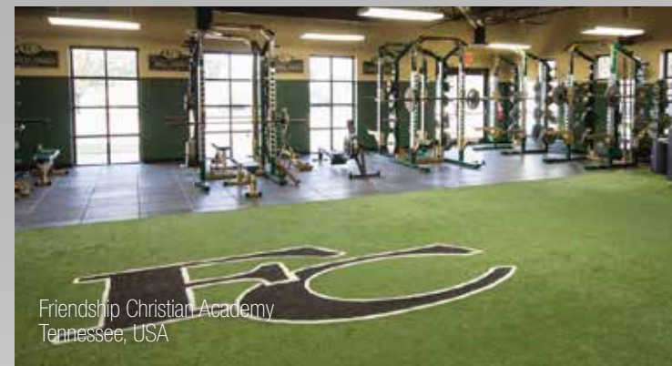
Friendship Christian Academy Tennessee, USA

Robust flooring is one of the most important parts of a gym. We have excellent partnerships with leaders in athletic flooring, plus installation experience. Whether you need rolled rubber, rubber tiles, or turf, we can meet your flooring needs.