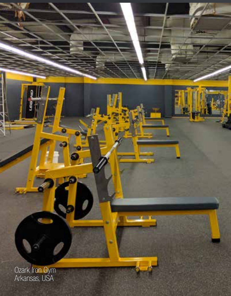
Ozark Iron Gym Arkansas, USA