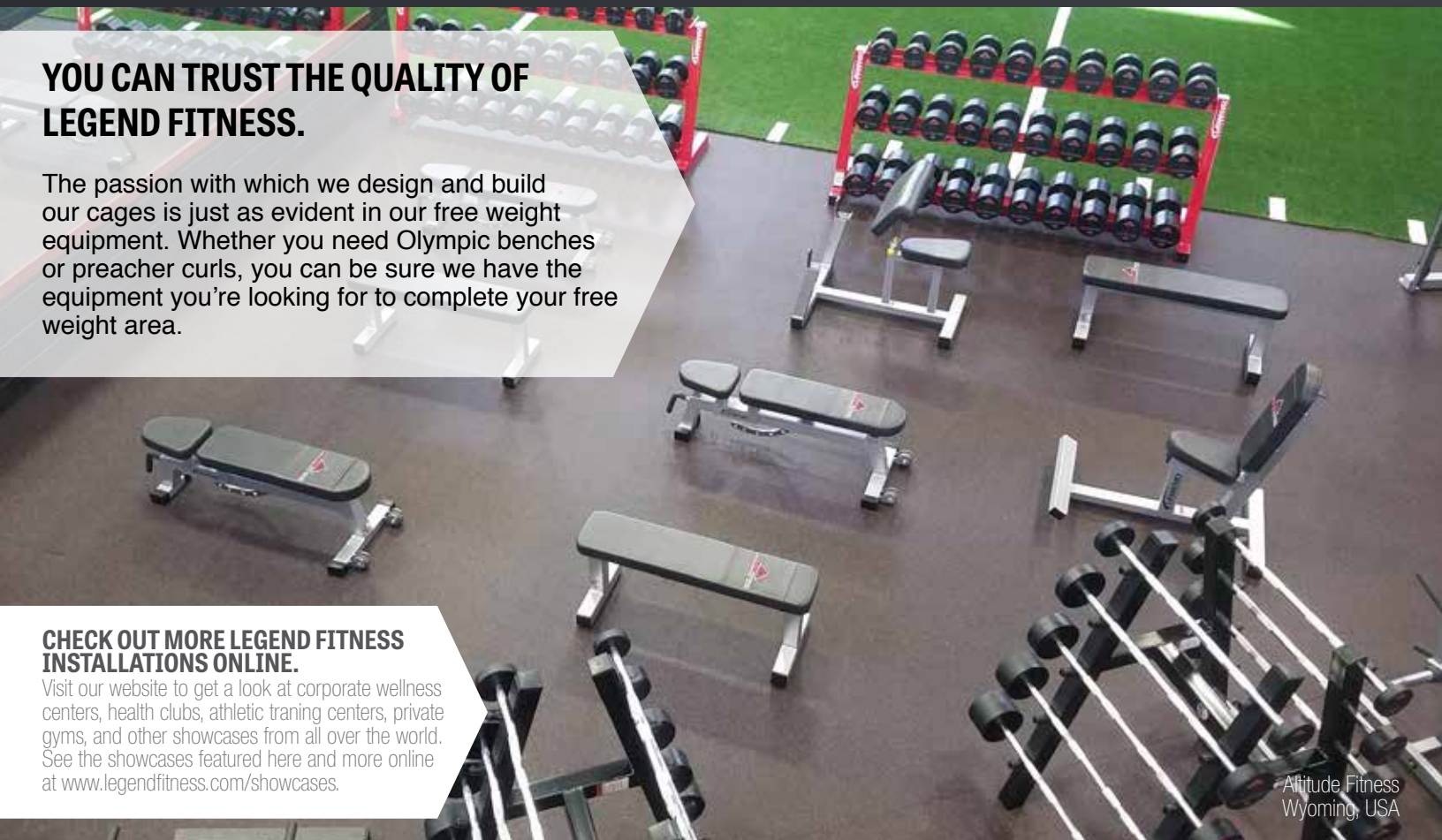
Altitude Fitness Wyoming, USA

Visit our website to get a look at corporate wellness centers, health clubs, athletic training centers, private gyms, and other showcases from all over the world. See the showcases featured here and more online at www.legendfitness.com/showcases .