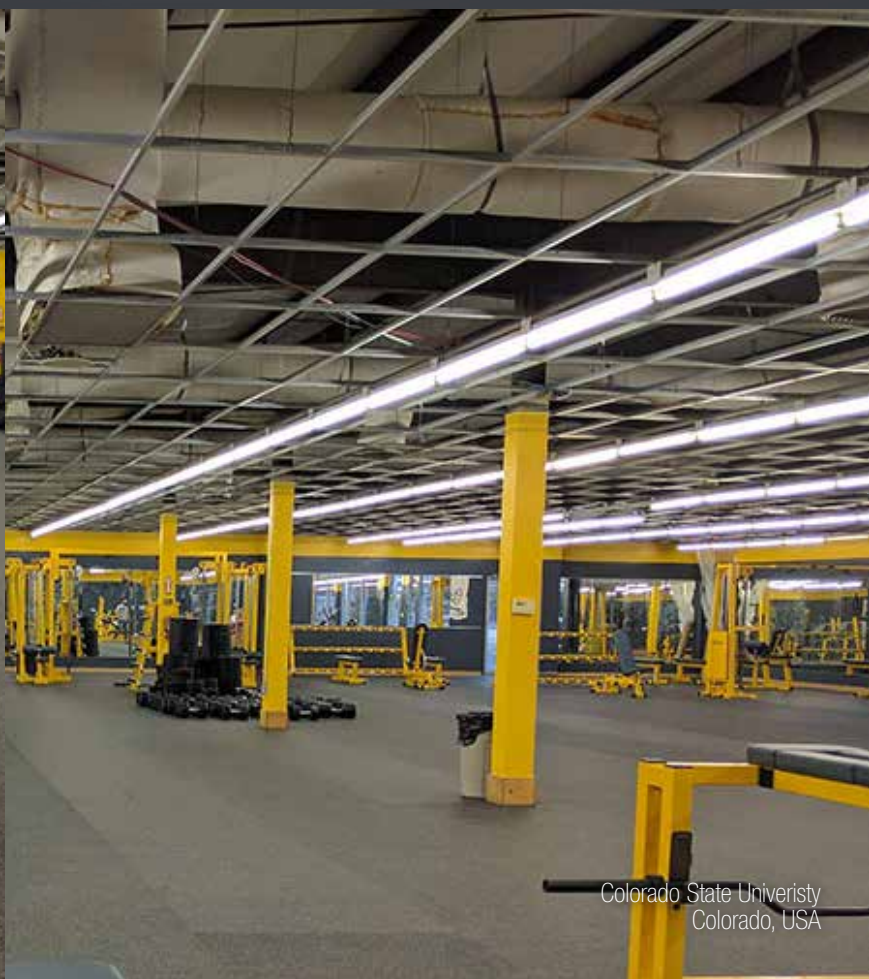
Colorado State University Colorado, USA