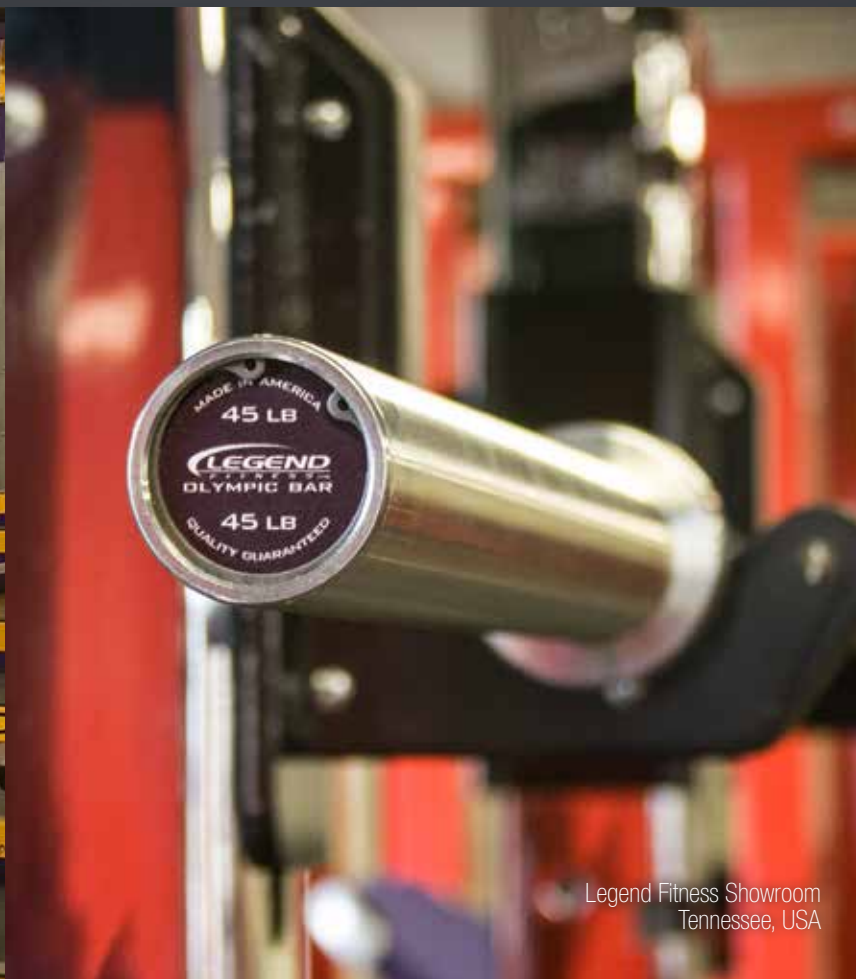
Legend Fitness Showroom Tennessee, USA