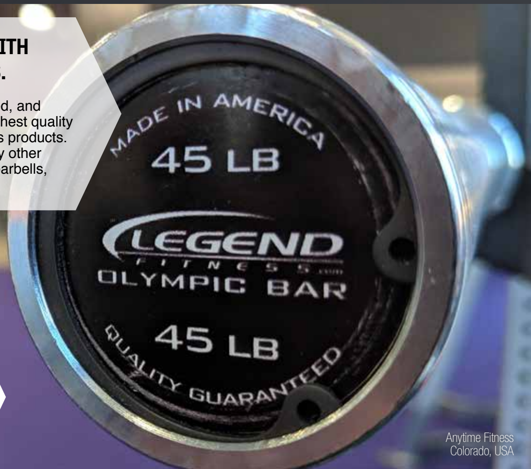
Anytime Fitness Colorado, USA

Visit our website to get a look at corporate wellness centers, health clubs, athletic training centers, private gyms, and other showcases from all over the world. See the showcases featured here and more online at www.legendfitness.com/showcases .