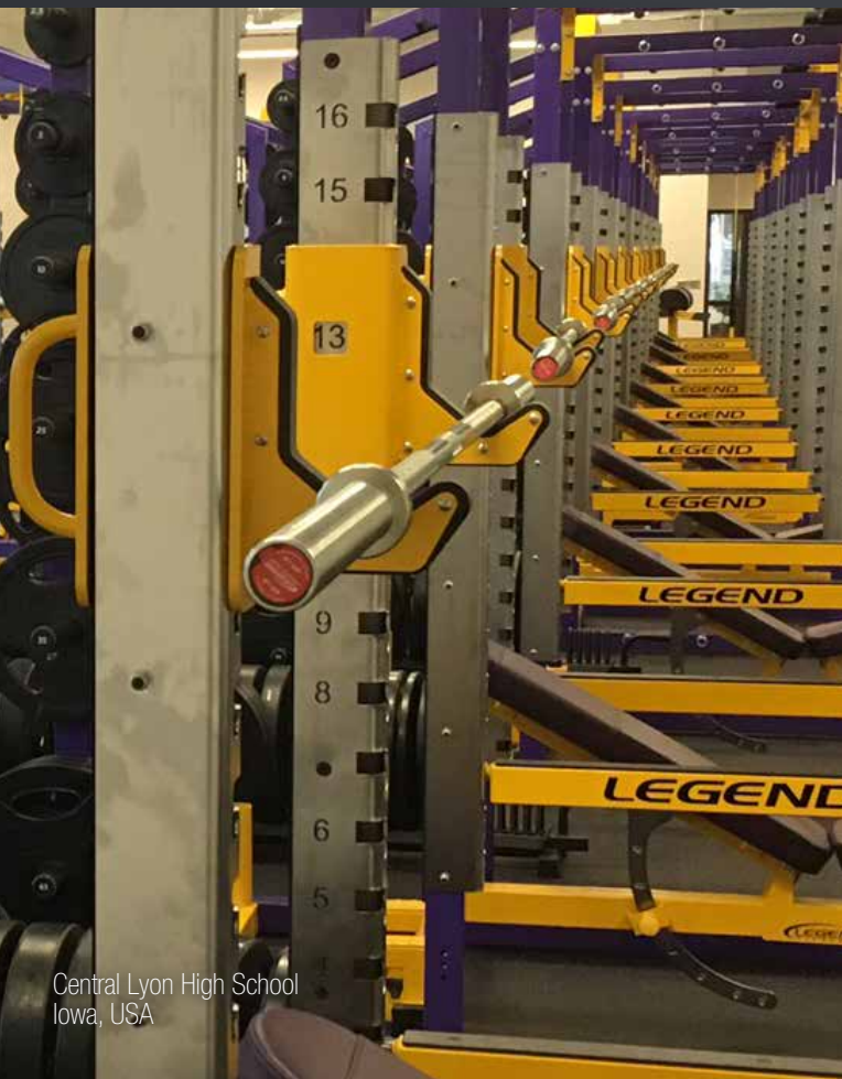
Central Lyon High School Iowa, USA