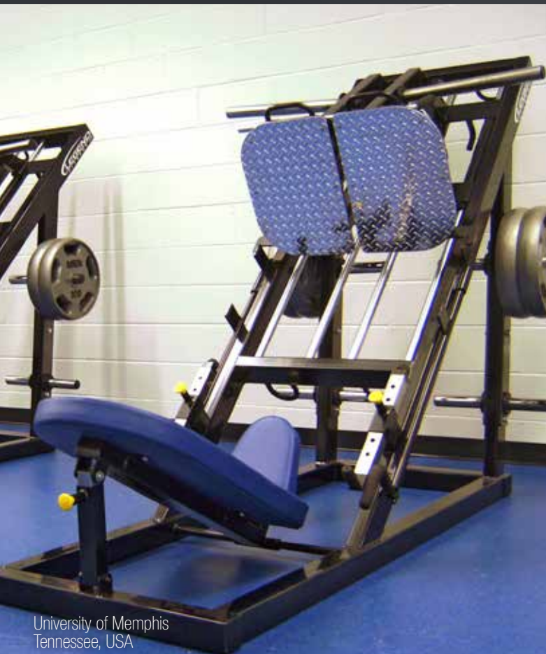
University of Memphis Tennessee, USA