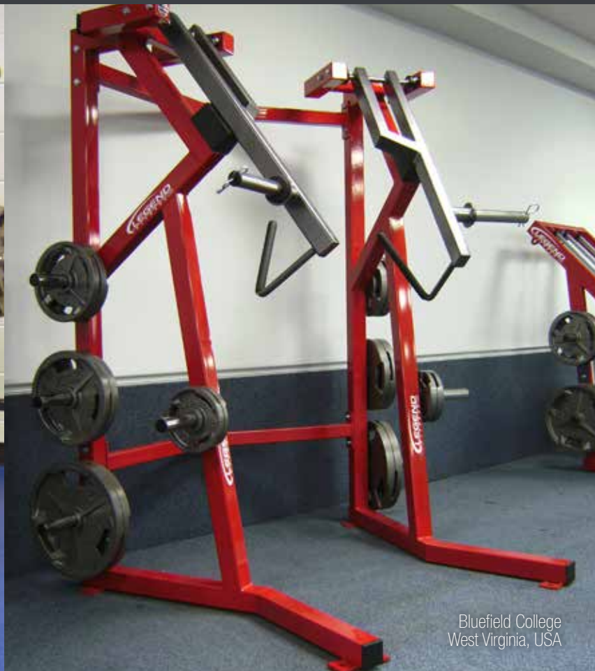
Bluefield College West Virginia, USA