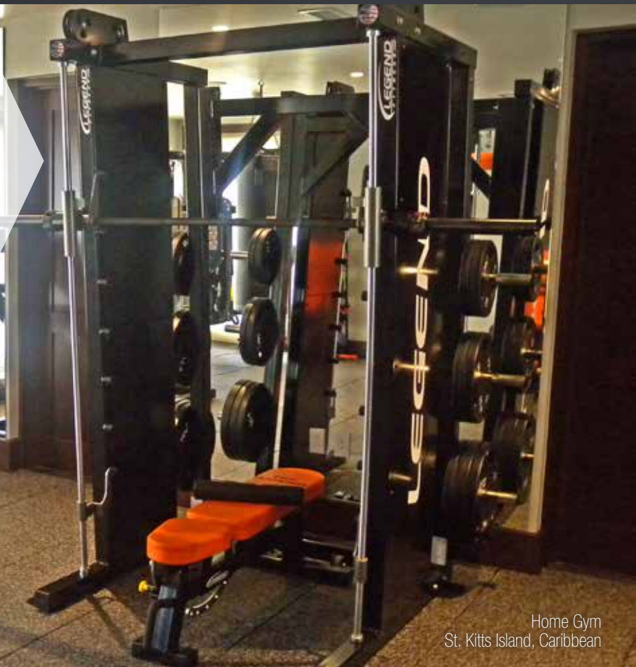
Home Gym St. Kitts Island, Caribbean

Visit our website to get a look at corporate wellness centers, health clubs, athletic training centers, private gyms, and other showcases from all over the world. See the showcases featured here and more online at www.legendfitness.com/showcases .