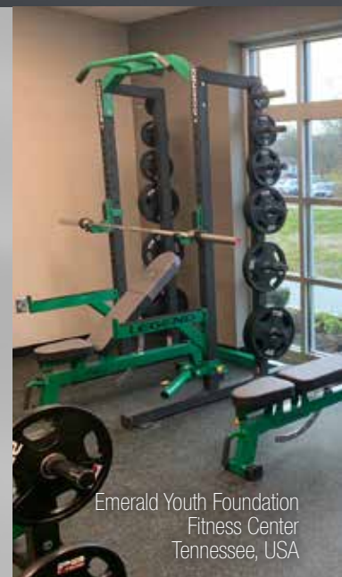
Emerald Youth Foundation Fitness Center Tennessee, USA