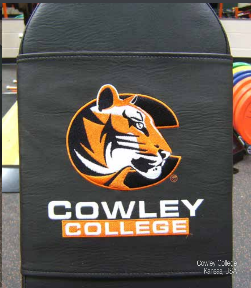
Cowley College Kansas, USA