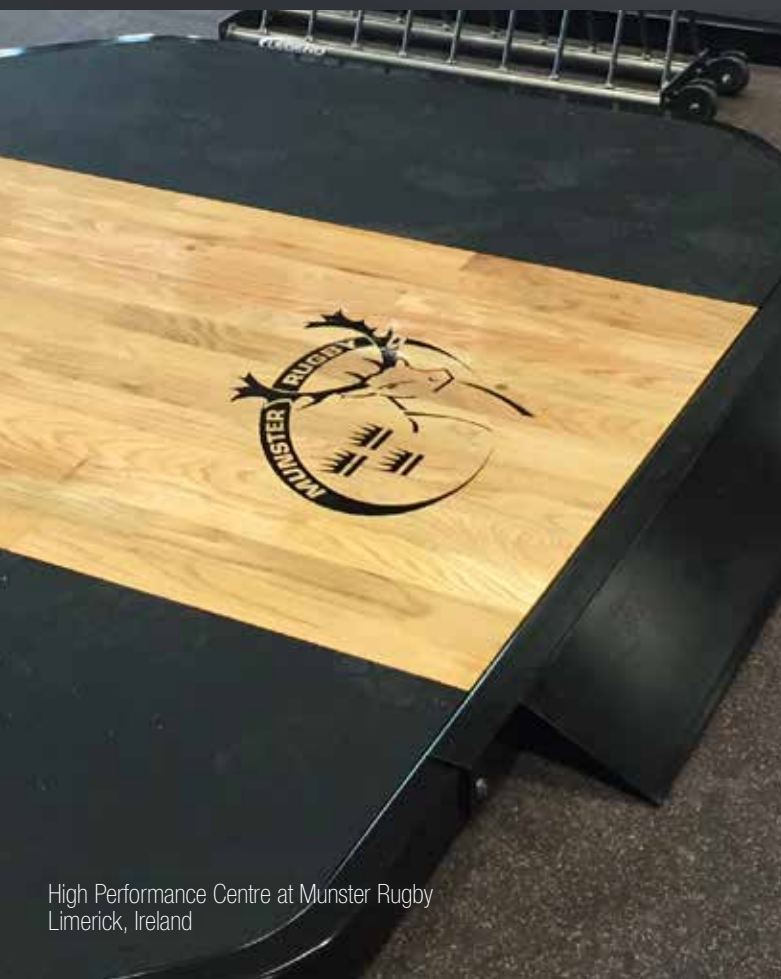
High Performance Centre at Munster Rugby Limerick, Ireland